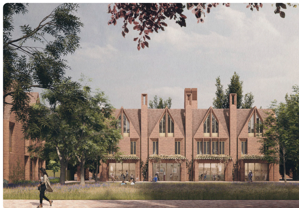
Artistic impression of the project