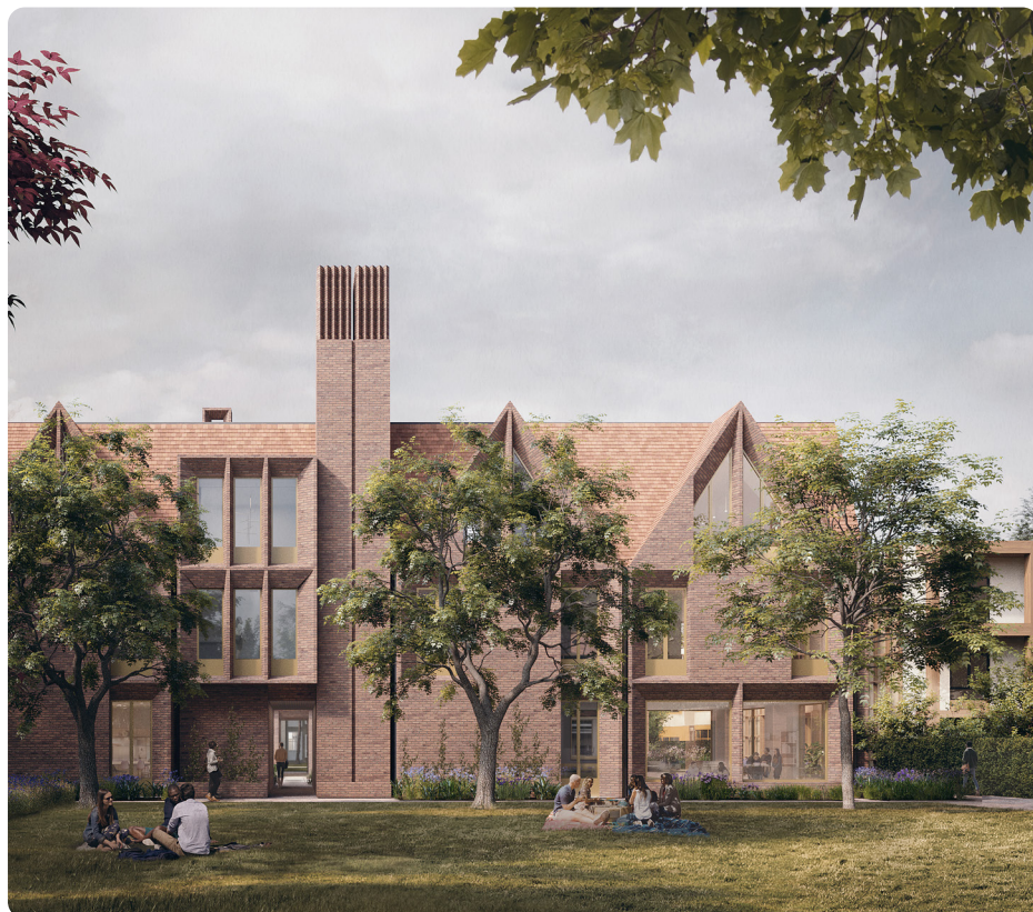
Artistic Impression of the Project