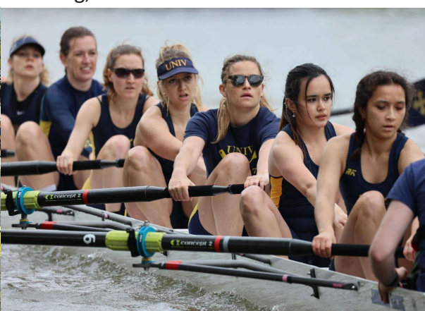
W2 racing during Summer Vllls

It's been a hugely successful term for the women*s side, which couldn't have been done without the support and time of our coaches- Argy, who's taken W2 to new heights and always reminds us to simply row well, and Pippa, who started as another of our lower boats' coaches this term and is sure to inspire us to success. As the term winds down and we head into the summer vacation, many of our rowers have taken up sculling, and a few intend to demonstrate