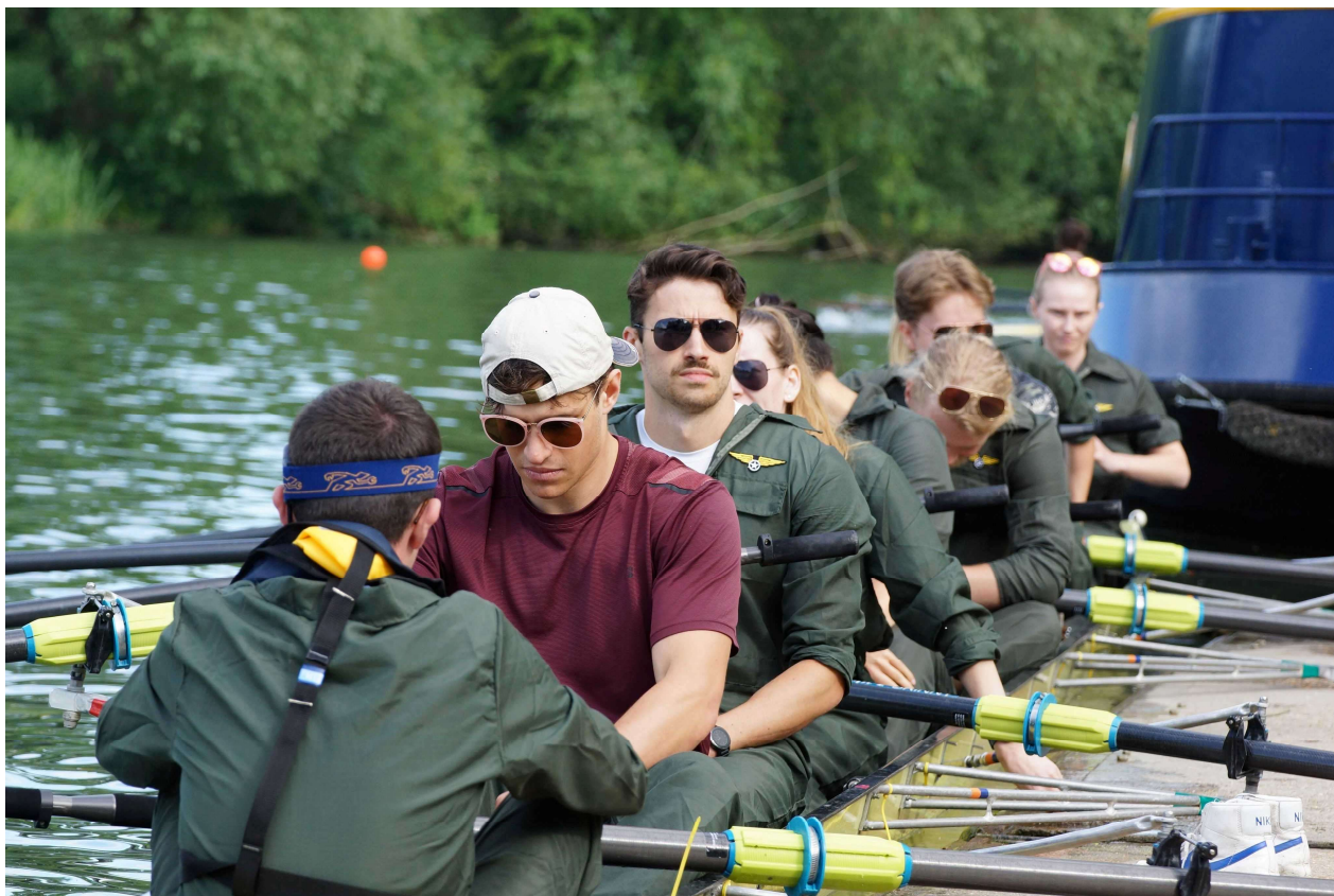
The Martlet/ Univ composite prepare to take flight in their Top Gun themed Oriel Regatta boat