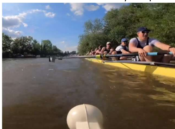
The view from the Bowball of the M1 boat shortly before Magdalen are bumped

Thursday and Friday saw Teddy Hall and Balliol despatched, with both being bumped before the Gut. The Thursday bump on