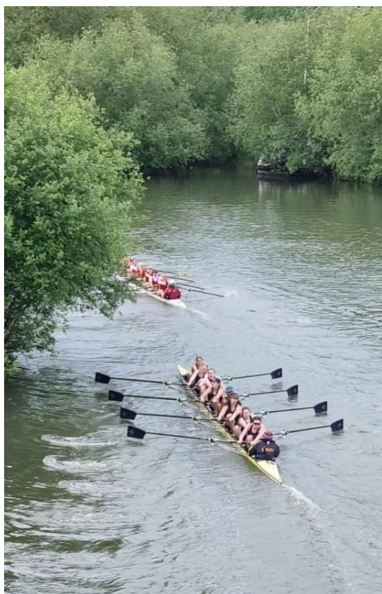
W1 on their way to bump Teddy Hall on the first day of Summer Vllls 2024