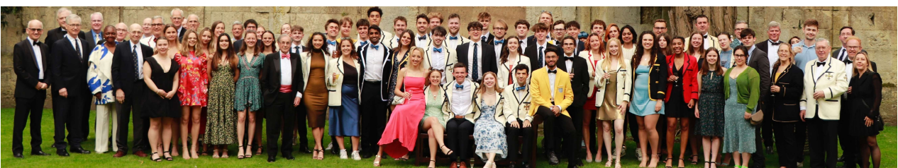
The whole club photo after Vllls 2024