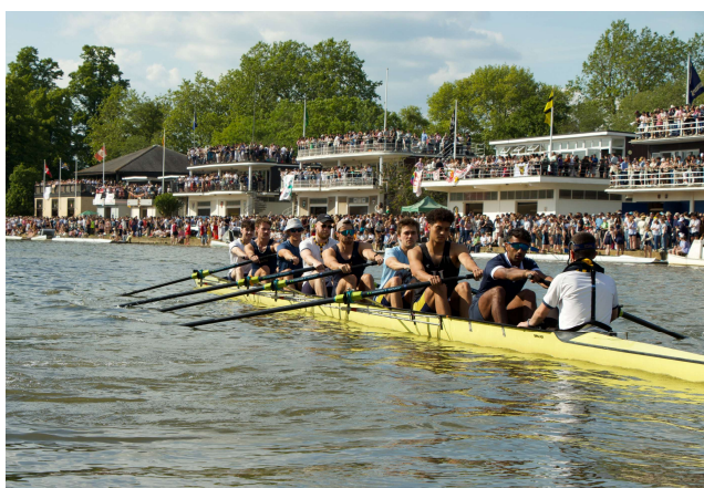
M1 making a rare appearance in front of Univ Boathouse during Eights