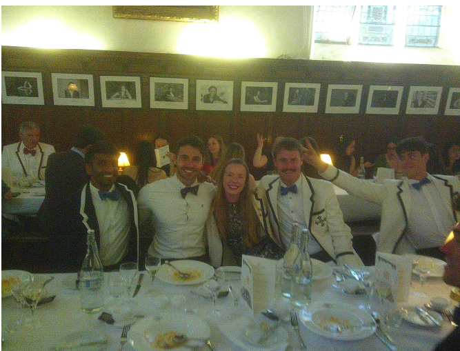
Various boat club members getting into the festive spirit at Eights Dinner