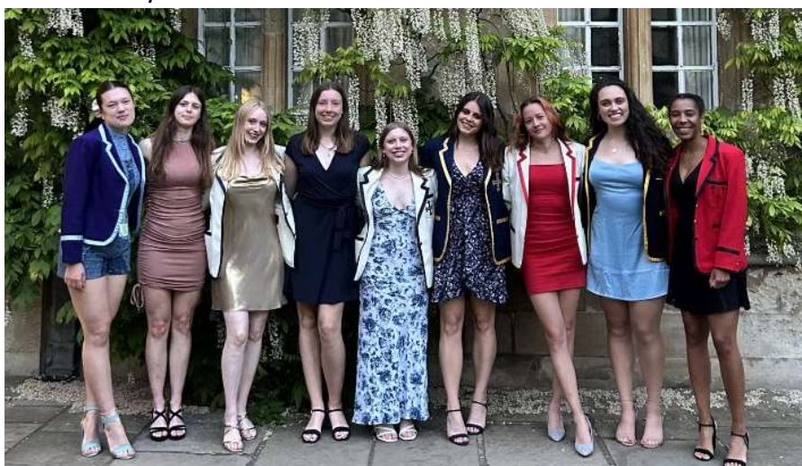
W1 at Summer Vllls dinner

After a successful bumps campaign, Univ continued to defy expectations at the Reading Amateur Regatta with 2 Univ crews entered from the Women*s side.