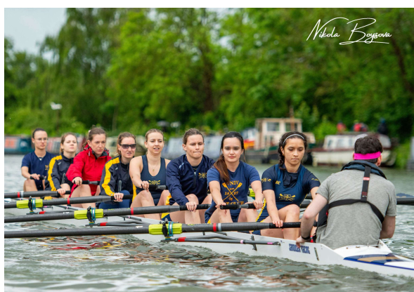
W2 rowing down to their bunline at the start of Summer Vllls