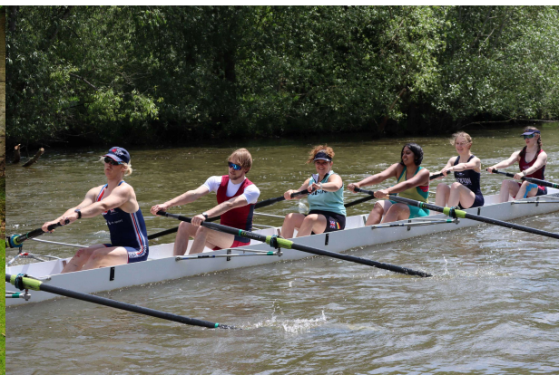
Right: The Beer Boat showing some impeccable fashion sense.