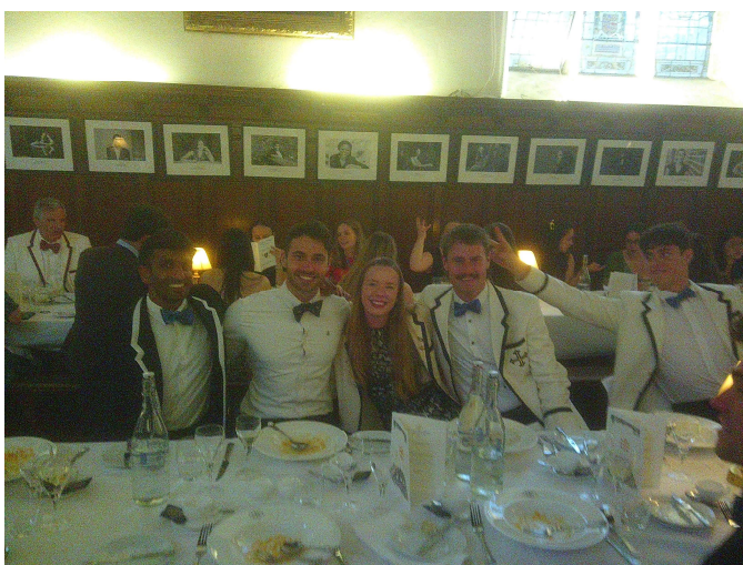
Various boat club members getting into the festive spirit at Eights Dinner