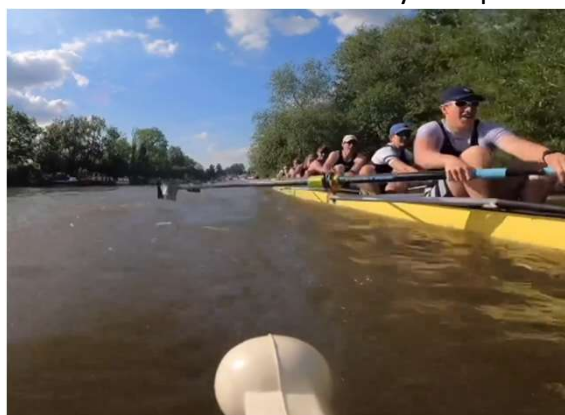
The view from the Bowball of the M1 boat shortly before Magdalen are bumped

Thursday and Friday saw Teddy Hall and Balliol despatched, with both being bumped before the Gut. The Thursday bump on